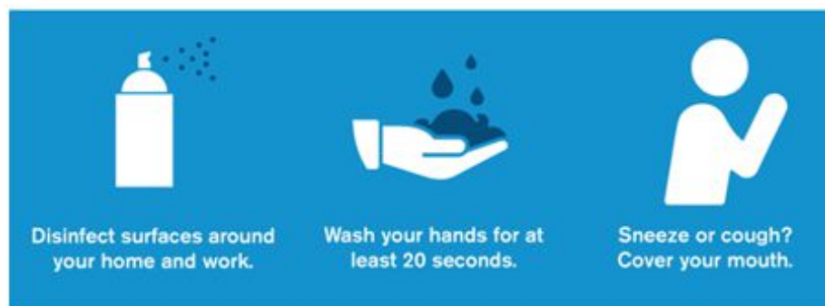
Figure 2: Corona virus safety. Follow these easy steps to help prevent the spread of COVID-19