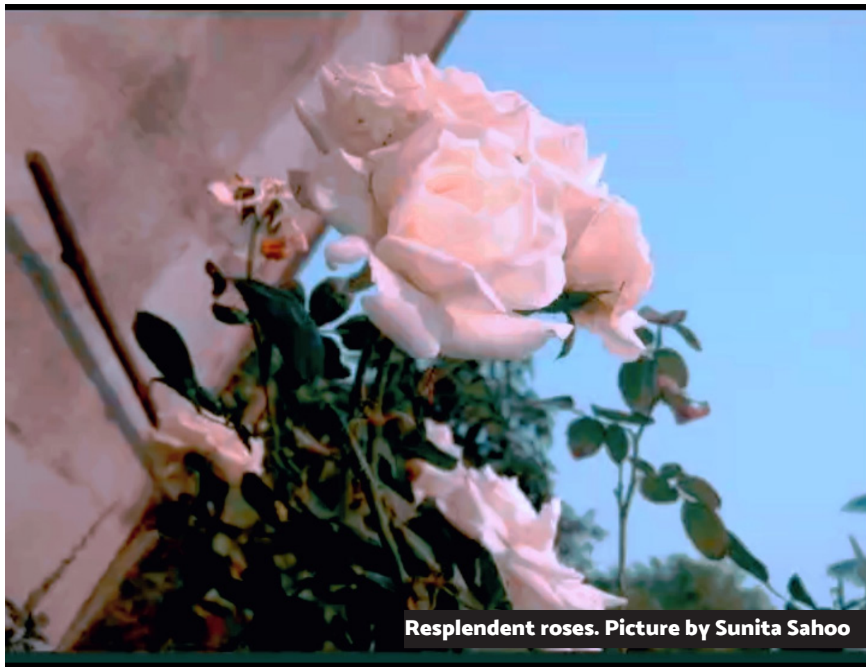
Resplendent roses.