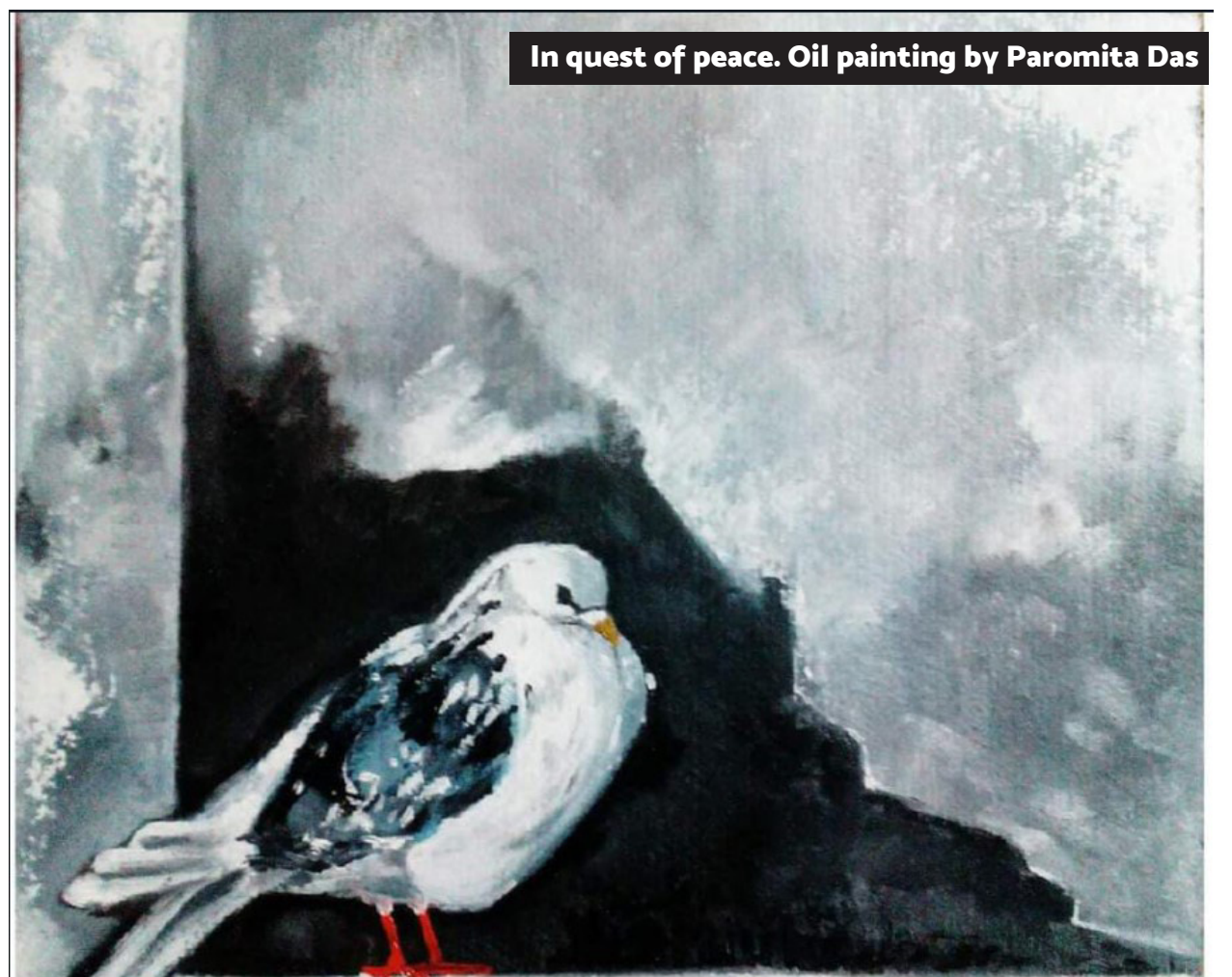
In quest of peace. Oil painting by Paromita Das