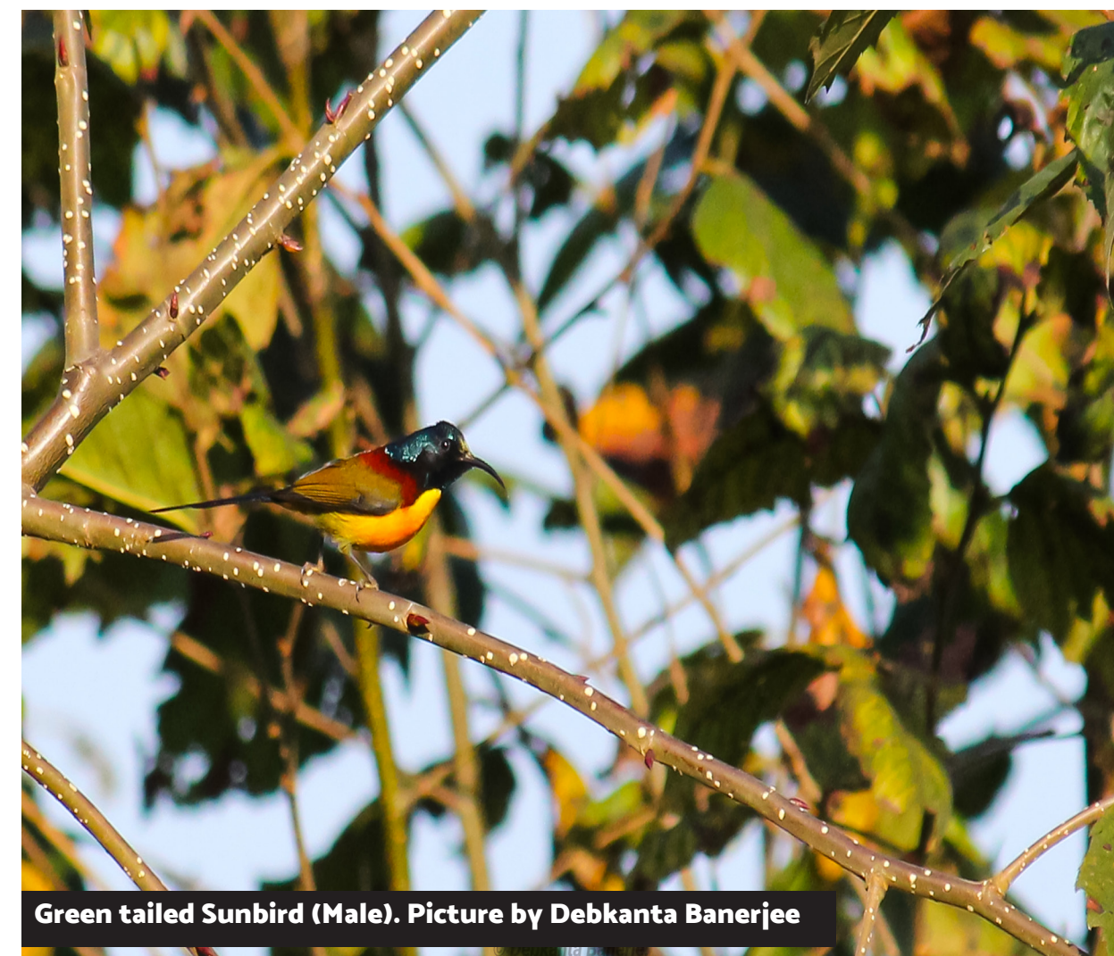
Green tailed Sunbird (Male).